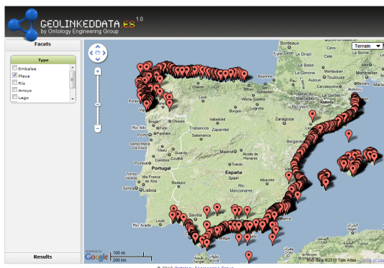
Figure 3: Screenshot of the web application

For the publication of the RDF data we rely on Virtuoso Universal Server 13 . On top of it, Pubby 14 is used for the visualization and navigation of the raw RDF data. On top of these two systems, we have developed a web based application 15 to enhance the visualization of the aggregated information. This interface combines the faceted browsing paradigm [9] with map-based visualization using the Google Maps API 16 . Thus for instance, the application is able to render on the map distinct geometrical representation such as LineStrings that depict to hydrographical features (reservoirs, beaches, rivers, etc.), or Points that show province capitals (see Figure 3).